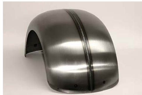
Baldy rigid 330 trimmed