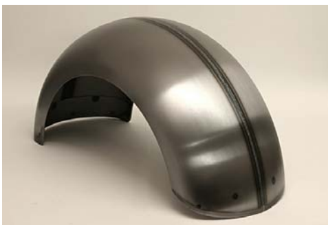
Baldy rigid 250 trimmed