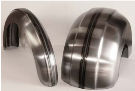
Mohawk pair, soft tail 250 Blank

AVAILABLE IN MOHAWK AND BALDY VERSIONS. FROM 180MM THRU 360MM BLANKS, OR TRIMMED, IN RIGID OR SOFTTAIL STYLES. MATCHING TANKS AVAILABLE SOON.