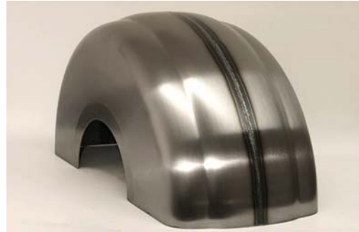
Mohawk soft tail 280 blank