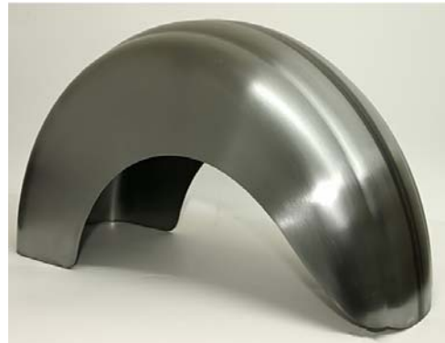
Mohawk soft tail 280 trimmed